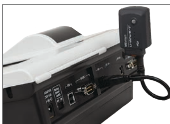
* SJ-410 Series with U-Wave Technology

To learn more regarding the SJ 410 range of portable surface roughness testers, and the specific model SJ-411 currently on sale, click below.