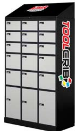
TOOLCRIB Lockers Locker Door Security For Large or Bulk Items

Additional add-on units include the TOOLBOX cabinet, TOOLCRIB Slave and TOOLCRIB Lockers. All of these add-on units are electronically controlled by the TOOLCRIB they are connected to. TOOLCRIB has the ability to accommodate 14 of these add-on units to 1 TOOLCRIB.